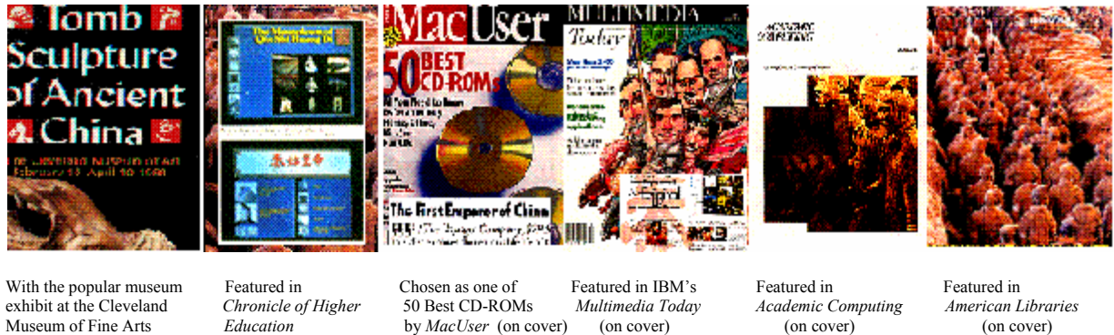
Figure 1. Some of the sample media coverage of the Emperor project

when I talked about how the multimedia technology will change the way we seek, demand, and use information (Figure 1).